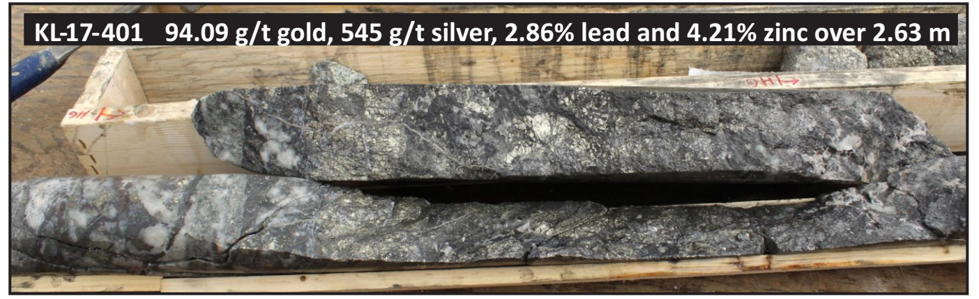
Klaza Property - Total Inferred and Indicated Mineral Resource Estimate Summary

Eleven known vein zones have been identified within the area of the Klaza Deposit. The most extensively explored zones, the BRX and Klaza zones have each been systematically traced along strike for 2,400 m and to depths of 520 m and 325 m down-dip, respectively. Neither zone outcrops, but mineralization has been exposed along the known length of the each zone in excavator trenches, beneath a 1 m to 2 m thick veneer of overburden. Mineral resources currently include the Klaza and BRX zones, and parts of the BYG and Pika zones. All zones are open for expansion along strike and down-dip.